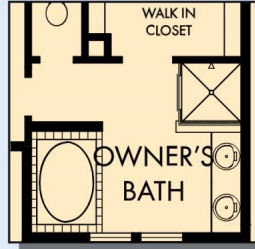
OPTIONAL DROP IN TUB SEPARATE SHOWER AT OWNER'S BATH