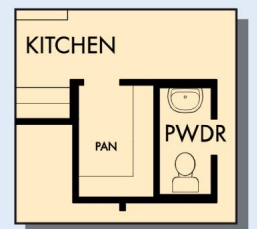
OPTIONAL POWDER BATH AT HALLWAY