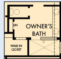
OPTIONAL WALK IN SHOWER AT OWNER'S BATH