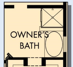
OPTIONAL SEPARATE TUB AND SHOWER AT OWNER'S BATH