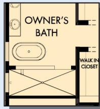
OPTIONAL FREE STANDING TUB WITH SEPARATE SUPER SHOWER AT OWNER'S BATH

3,226 - 3,234 sq. ft. • 4 Bedrooms • 3 - 4 Full Baths • 1 Half Bath • 3 Car Garage