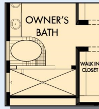
OPTIONAL DROP IN TUB WITH SUPER SHOWER AT OWNER'S BATH