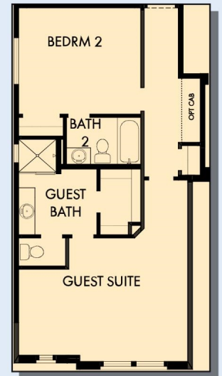
OPTIONAL GUEST SUITE WITH GUEST BATH AT BEDROOM 3