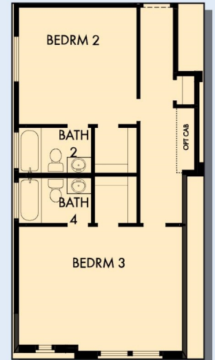
OPTIONAL EXTENDED BEDROOM 2 AND 3 WITH BATH 4