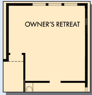
OPTIONAL EXTENDED OWNER'S RETREAT