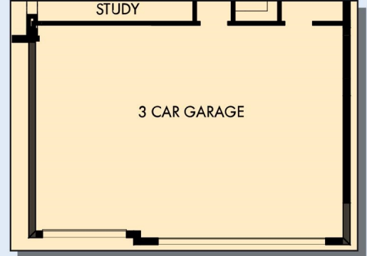
OPTIONAL 3 CAR GARAGE