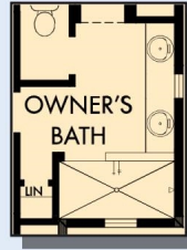
OWNER'S BATH OPTIONAL SUPER SHOWER AT OWNER'S BATH