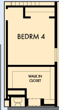
OPTIONAL BEDROOM 4 AT RETREAT

For additional options, please visit DavidWeekleyHomes.com