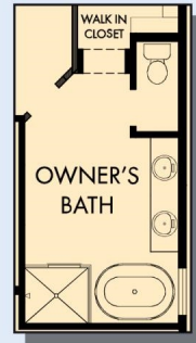
OPTIONAL FREE-STANDING TUB WITH SEPARATE SHOWER AT OWNER'S BATH