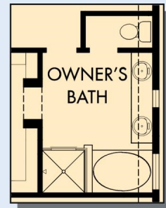
OPTIONAL SLIDE IN TUB WITH SEPARATE SHOWER AT OWNER'S BATH