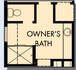
OPTIONAL SHOWER AT OWNER'S BATH