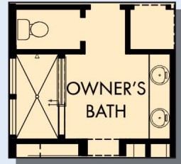
OPTIONAL WALK-IN SHOWER AT OWNER'S BATH