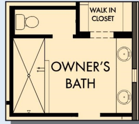
OPTIONAL SUPER SHOWER AYT OWNER'S BATH