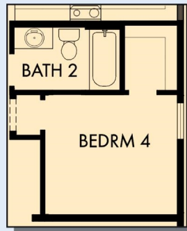
OPTIONAL BEDROOM 4 AT STUDY

2,112 - 2,126 sq. ft. • 3 - 4 Bedrooms • 3 Full Baths • 2 Car Garage