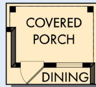
OPTIONAL EXTENDED COVERED PORCH