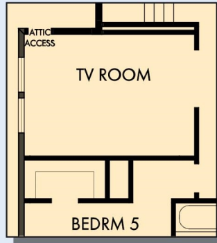
OPTIONAL TV ROOM AT RETREAT