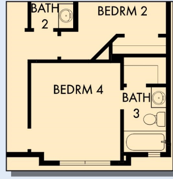
OPTIONAL BEDROOM 4 WITH BATH 3 AT RETREAT