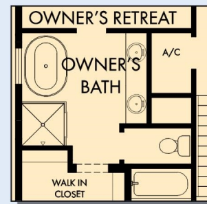
OPTIONAL FREE-STANDING TUB WITH SEPARATE SHOWER AT OWNER'S BATH

For additional options, please visit DavidWeekleyHomes.com