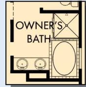
OPTIONAL DROP-IN TUB WITH SEPARATE SHOWER AT OWNER'S BATH