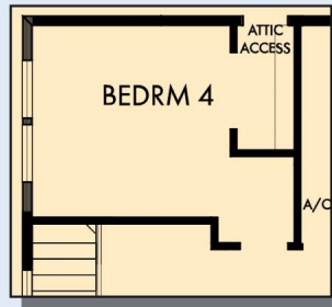
OPTIONAL BEDROOM 4 AT RETREAT