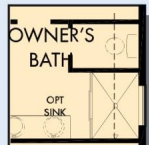
OWNER'S BATH OPT SINK OPTIONAL SHOWER AT OWNER'S BATH