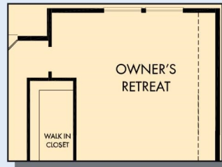
OWNER'S RETREAT WALK IN CLOSET OPTIONAL EXTENDED OWNER'S RETREAT