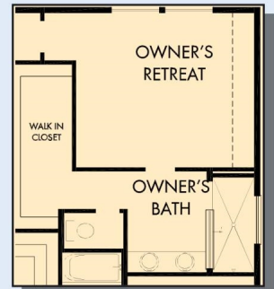
OWNER'S RETREAT WALK IN CLOSET OWNER'S BATH OPTIONAL WALK-IN SHOWER AT OWNER'S BATH