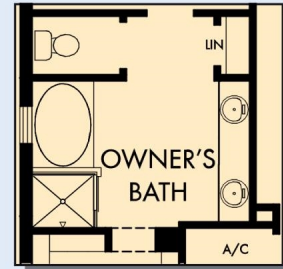
OPTIONAL SLIDE-IN TUB WITH SEPARATE SHOWER AT OWNER'S BATH