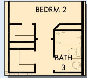
OPTIONAL BATH 3 AT BEDROOM 2