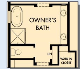
OPTIONAL FREE STANDING TUB AND SEPARATE SHOWER AT OWNER'S BATH