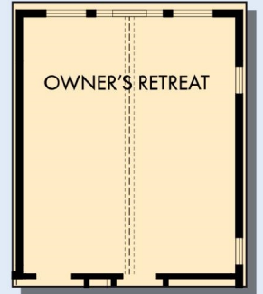
OPTIONAL EXTENDED OWNER'S RETREAT