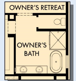
OPTIONAL FREE-STANDING TUB WITH SEPARATE SHOWER AT OWNER'S BATH