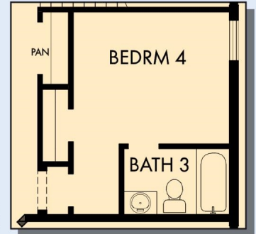
OPTIONAL BEDROOM 4 AND BATH 3 AT STUDY