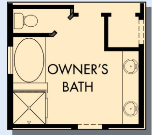
OPTIONAL SLIDE-IN TUB WITH SEPARATE SHOWER AT OWNER'S BATH