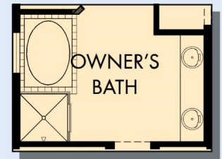
OPTIONAL DROP-IN TUB WITH SEPARATE SHOWER AT OWNER'S BATH